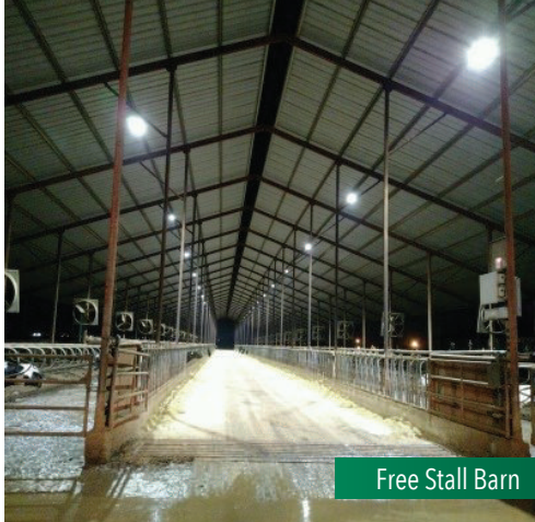
Free Stall Barn